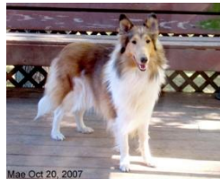
Mae Oct 20, 2007