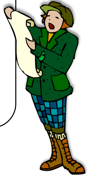
Albert, the Err-dale