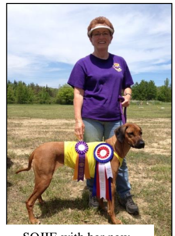
SOJIE with her new BEST IN FIELD ribbons

Ariel won the breed (a major) May 18 over young dogs (including 2 of her daughters) at the Northcoast Coursing club trial in Austintown, Ohio. No bitch like an old bitch !